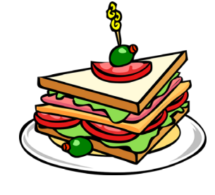
Eating a sandwich