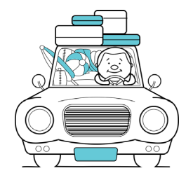
Driving from Manchester to London