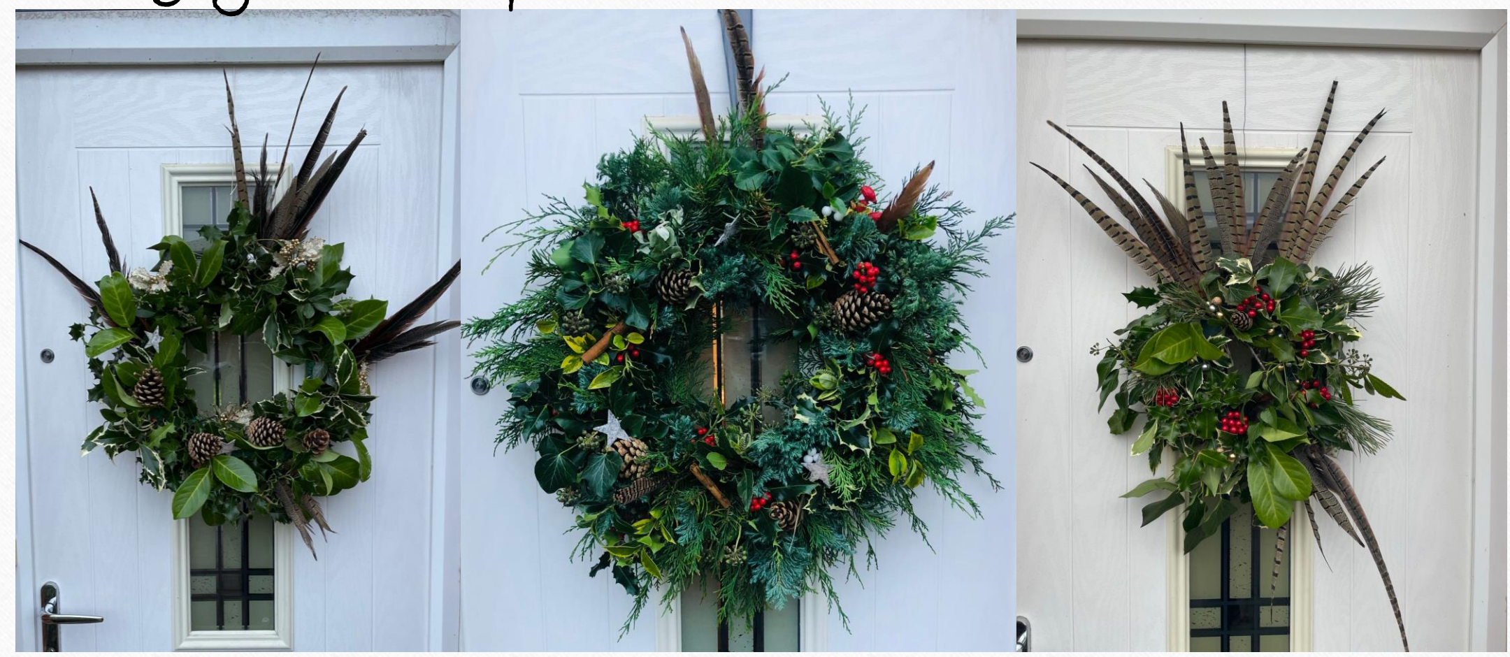
Thank you for supporting our PTFA.